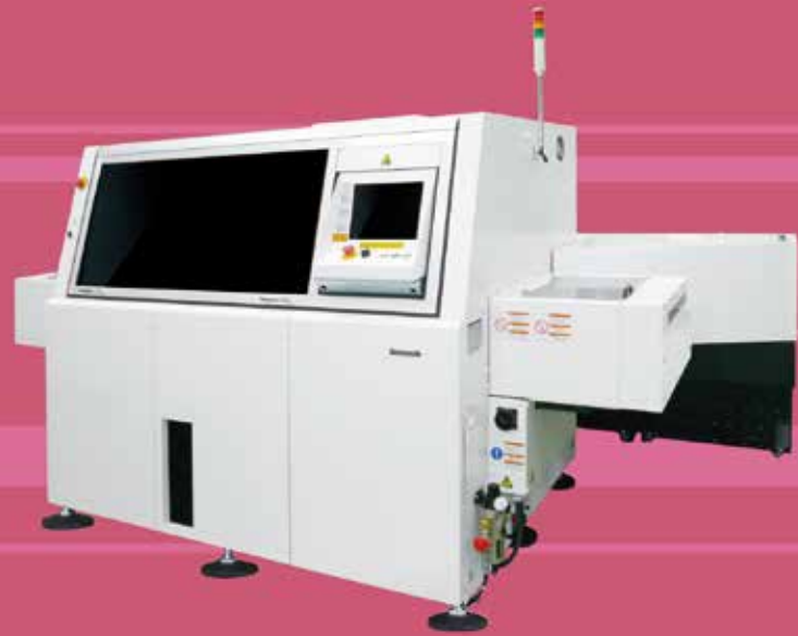
Model No. NM-EJR4A